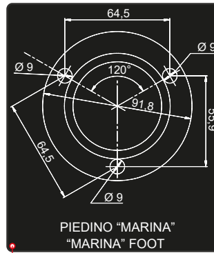
PIEDINO "MARINA" "MARINA" FOOT